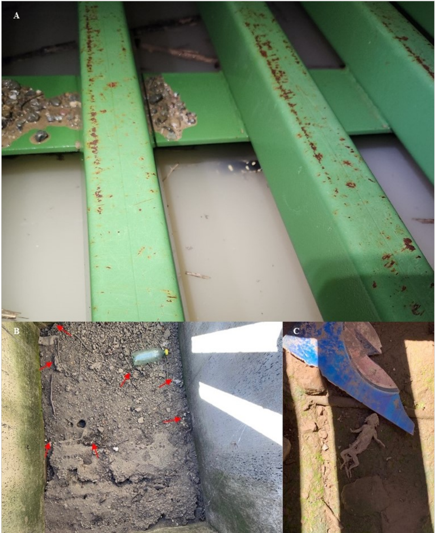
Figure 3. Entrapped wildlife encountered during cattle guard samples. A) a California tiger salamander trapped in a flooded cattle guard, Contra Costa County, CA, December 2022, photo by